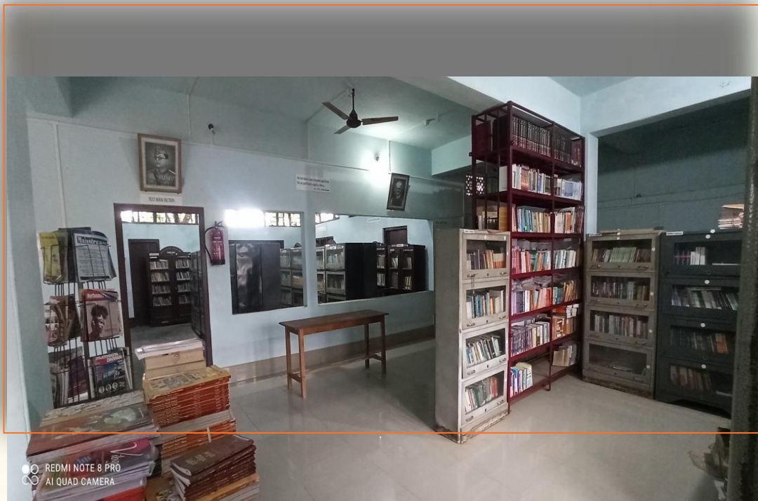
R.K. Nagar College Central Library